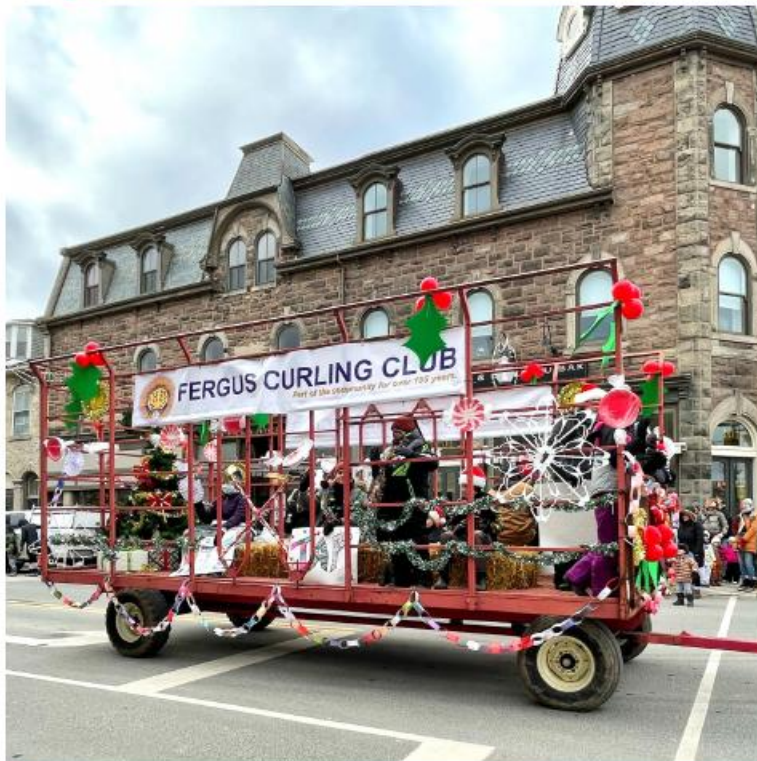
Here is another photo of the club's float in the Fergus Santa Claus parade by Lynda Waterhouse.